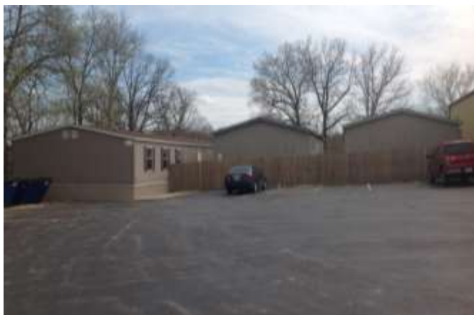
Future site of the Chadwick R-1 Early Childhood Learning Center

During FY2014 SMCOG also assisted the Chadwick R-1 School District with their Community Development Block Grant Start Smart application for the building of a new early childhood education center. The project received a $937,500 CDBG award from the Missouri Department of Economic Development in August 2014 and SMCOG was selected to provide administration services for the project. The Release of Funds for the project was issued by MoDED in March 2015 and construction is scheduled to start in July.