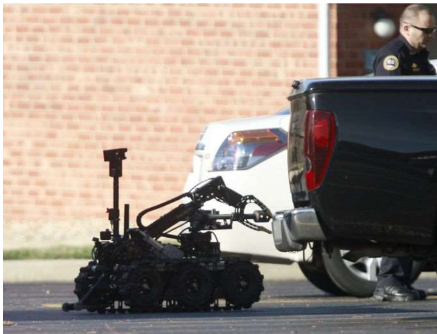
Robot purchased for Bomb Squad responding to an event during year

The FY14 projects are similar to those funded through the FY13 Regional Grant: to continue communications sustainment; Chemical, Bomb, Radiological, Nuclear and Explosive (CBRNE) sustainment; and Community Emergency Response Team (CERT), Incident Support Team and Structural Collapse training. The RHSOC met several times throughout the year to discuss various issues within the Region and the State, be advised of the purchasing status, re-appropriate funding and determine the projects for the FY14 grant application.