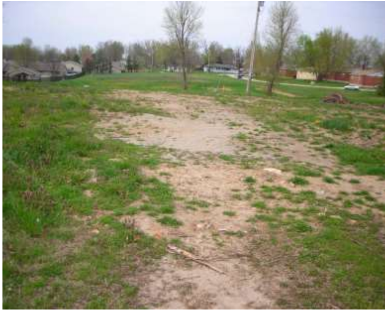
Future Site of the Marshfield Senior Center

approved and SMCOG is providing CDBG administration services for the project. Release of Funding for the project is scheduled for July 2015.